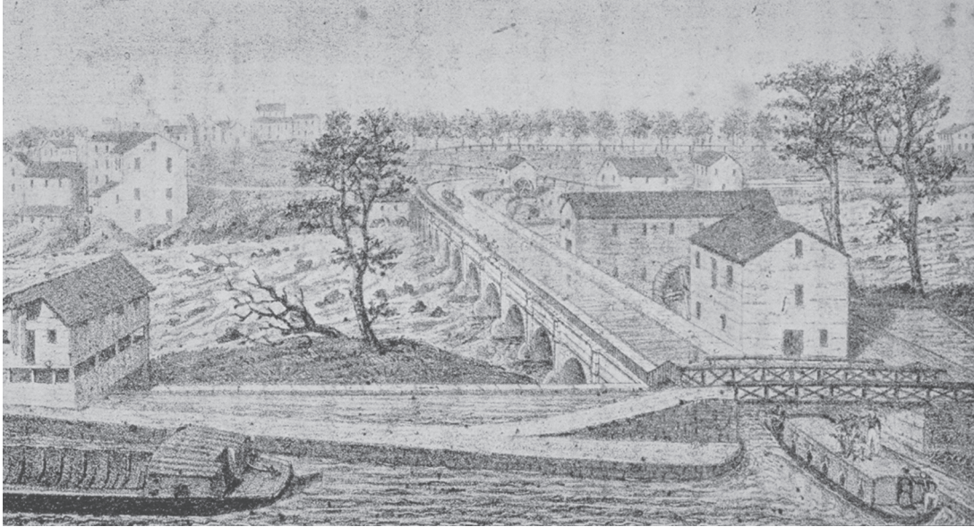
Erie Canal Aqueduct, Rochester, New York

Which of these resulted from the modification to the environment shown in this illustration?